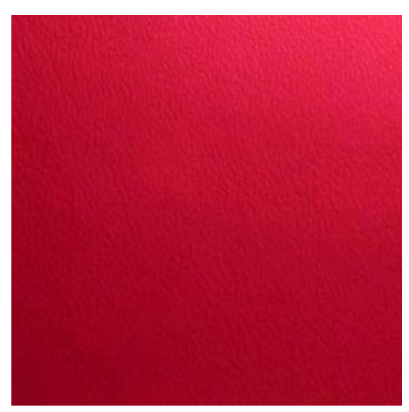
Repeats Not Shown to Scale.