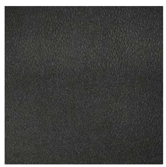
Repeats Not Shown to Scale.