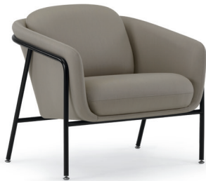
Frame finish in satin black.