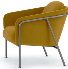
Frame finish in metallic silver.