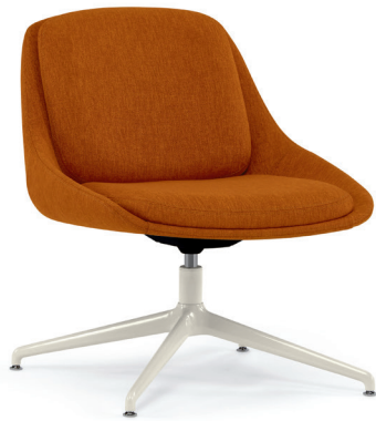
Metal swivel base, premium finish in stone.