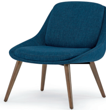
4-leg wood base finished in smoky umber ash.