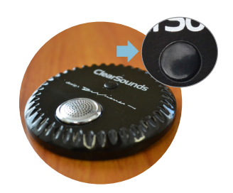
STEP 1: Place BT4 Removable Mic in a position that best captures the voice(s) that you want to hear. On the BT4 Removable Mic, press the multifunction button and the Mic will become active.