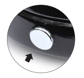
STEP 2: Ensure QUATTRO 4L is turned off. Press and hold multi-function button for approximately six seconds, until "Pairing" is announced.