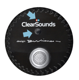
STEP 3: On the Mic, press and hold BUTTON until light flashes red and blue.