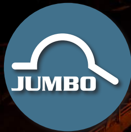
JUMBO ROLL FOAM SURROUND

Cone designed using Finite Element Analysis to ensure maximum rigidity to weight ratio.