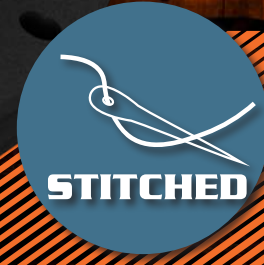
STITCHED TINSEL LEADS

The black anodized Voice coil former is used for aiding heat dissipation, this acts as a heatsink and pulls the heat away from the VC wires to increase with power and thermal handling