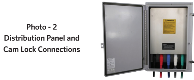
Photo - 2 Distribution Panel and Cam Lock Connections