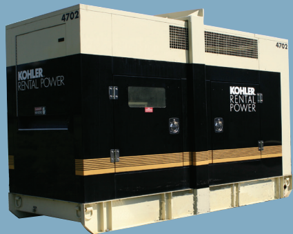
Typical sound attenuated rental generator

This info sheet outlines how noise is measured, lists acceptable ranges, gives comparative scales, and details the sound attenuation technology being adopted to reduce generator noise emissions. (see Diagram Two)