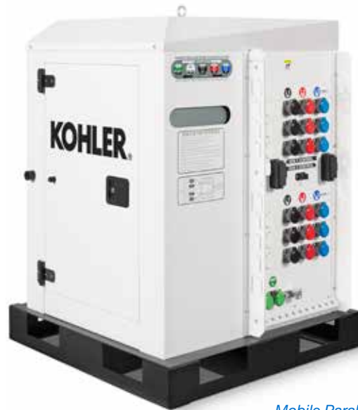
Mobile Paralleling Box

The KOHLER Mobile Paralleling Box provides the flexibility to parallel any Tier 4 Final or gaseous KOHLER mobile generators to meet job requirements—without the need for expensive motorized breakers. And thanks to the paralleling intelligence built into the DEC3500 controller, each box can parallel two generators. Up to four paralleling boxes and eight generator sets can be connected to one distribution bus.