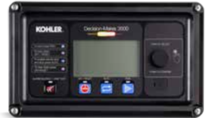
3500 - available on mobile generators only