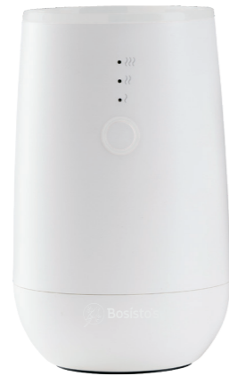
OPERATING MANUAL - MODEL 89