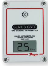
Wall mount with LCD