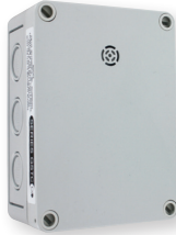
Wall mount without LCD