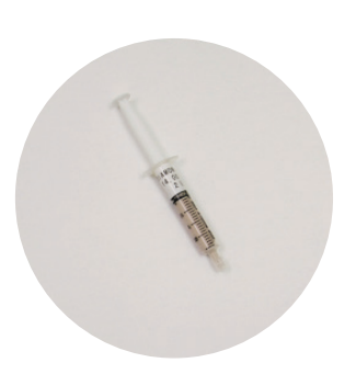
Tech-10 polishing pad with 14,000# diamond paste syringe