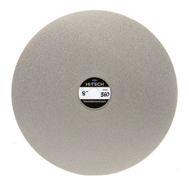
360# diamond disc

The 1,200# diamond disc will remove scratches left behind from step 2. Install the 1,200# disc according to the instructions on page 7. Proceed to grind until you have a finely frosted surface. A properly shaped surface is perfectly smooth and satiny in appearance. Rinsed and dried, you should not see any scales (aka dimples, facets, flats, etc.) or scratches. Hold it up to a bright light and look for deep lines. Scales are most easily observed by watching the piece dry. Because the "scales" will have deeper puddles of water, they will evaporate more slowly. Wet your piece and watch for this phenomenon. If you see any scratches or scales, you may not have smoothed long enough. If after additional smoothing you