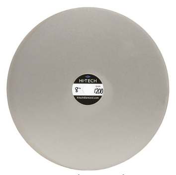
1,200# diamond disc