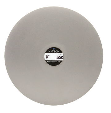
3,000# diamond disc

The Tech-10 polishing pad is used to put the final polish on your material. You will need to charge the Tech-10 polishing pad with the 14,000# diamond paste before use. To do this, take the diamond paste syringe, remove the cap and squeeze the syringe plunger in a series of small dots onto the surface of the Tech-10 pad (Fig. C). Use your fingers to rub these small dots into the pad. Once charged, you will only need to apply additional diamond paste to the pad when you notice that the pad is no longer polishing. Using the Tech-10 polishing pad with water is not required because the diamond compound mixture contains its own carriers. However, if vou are working with brittle, heat sensitive material, such as opal, be careful not to let your work piece overheat. To avoid overheating, use a very small amount of clean water to keep your work piece cool or simply lower the RPM to reduce heat buildup. Note: Use only one type of polishing compound per Tech-10 polishing pad. Do not mix.