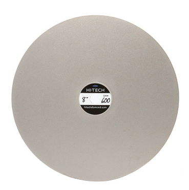
600# diamond disc