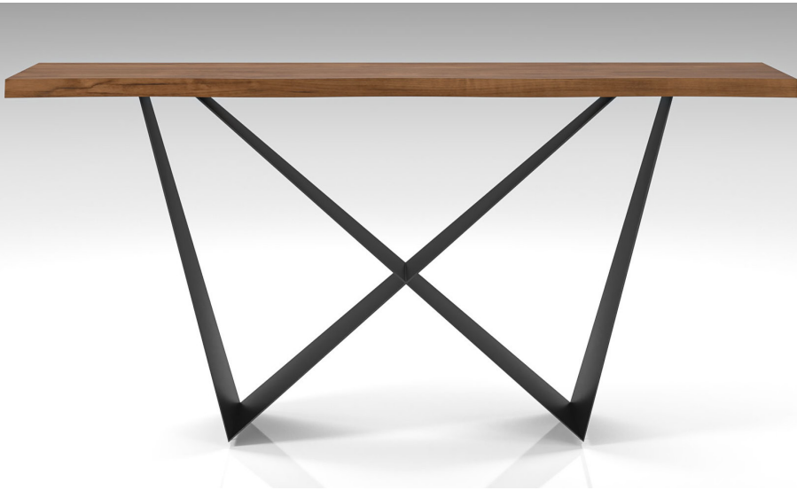
ASCOLI COLLECTION: Dining Table | Console