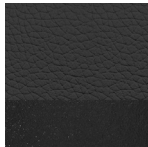
Dark Gray Leather|Black Metal