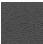
Dark Gray Leather