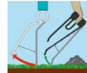
Thanks to their high flexibility, the dragging Fendt Performance tines can also avoid obstacles much more easily than conventional tines. On the Lotus, tine breakage just isn't an issue.