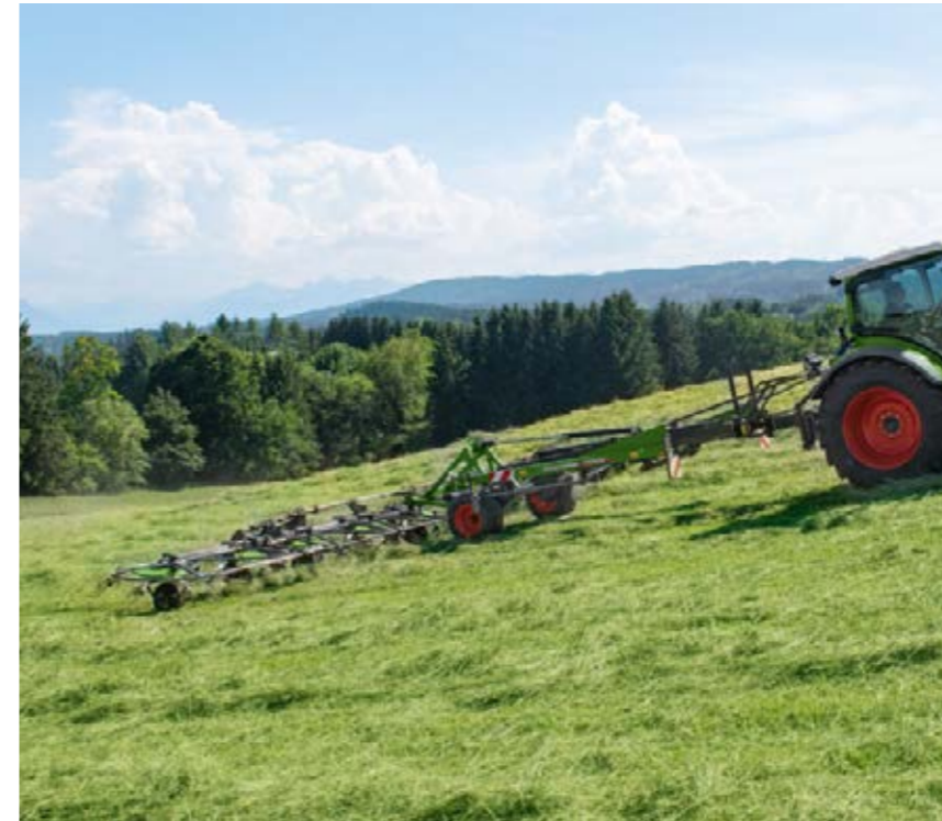
Spread over the working width, there are several swivel joints between the rotors that make sure each one individually adapts to the ground. Low wear and clean feed, guaranteed.