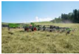
Attached Lotus models stand for both maximum impact and outstanding feed protection.