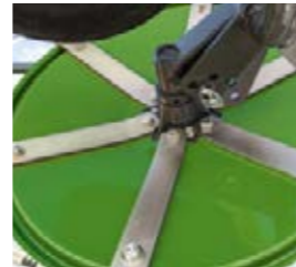
Large rotor plates mean the tine speed remains high at a low rotor speed.