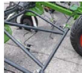
The towed tedders have an extra grid frame for maximum stability, both for protection and to reinforce the main frame across the full machine width.