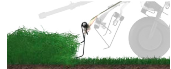
The extra stable tine arms are designed for high power transmission and maximum durability.