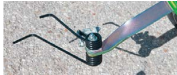
The special tine attachment with adjustable positioning angle means you can easily switch to boundary spreading or night swaths while protecting against tine loss.