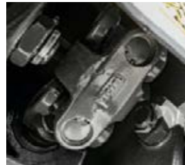
The maintenance-free double-cross joints ensure direct power transfer and means the tedder can turn even in the folded transport position.