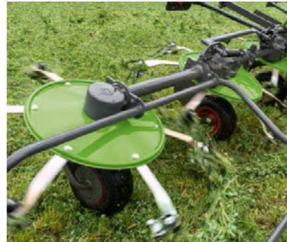
Voluminous tyres on every rotor for excellent feed intake and ground adjustment.