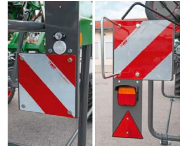
For increased road safety, attached Lotus models have extra-large warning signs and follow the main lighting actions as standard.