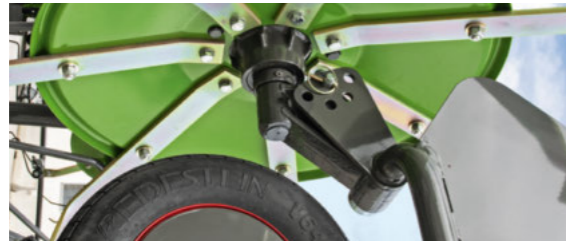
Simply move a single bolt to easily adjust the spreading angle position. You have a choice of 5 settings from 10° to 17° – precisely adapted to your needs, every time.