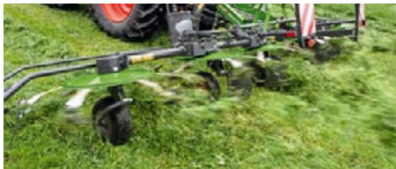
The anti-wrapping system prevents the crop from wrapping itself around the wheel axle.