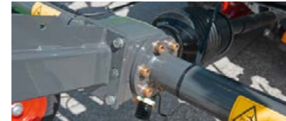
The overload protection on the main drive joint shaft increases operational reliability and makes the Lotus tedder drive train exceptional durable.