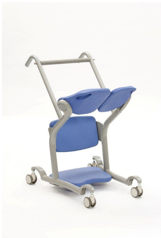
PT003 (Able Assist with Rigid Legs)