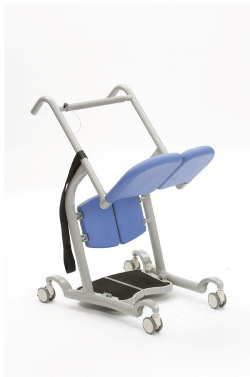
PT005 (Able Assist with Folding Facility)