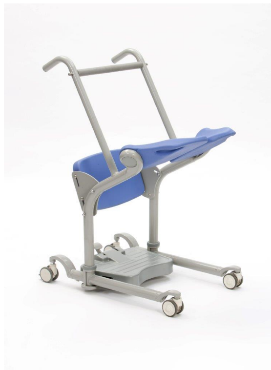
PT004 (Able Assist with Adjustable Legs)