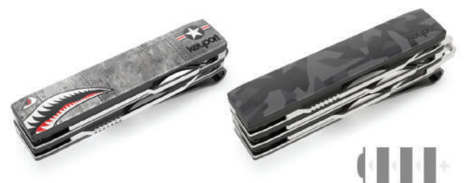
3-4X STACKS // 3-4 MODULES PER POC