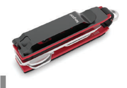
PIVOT STACKS // STACK MODULES & FACEPLATES ON BOTH SIDES OF THE CHASSIS