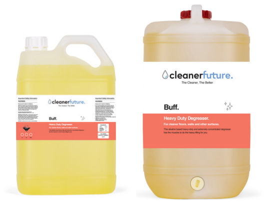
Buff Heavy Duty Degreaser Part Number: BUFF-599 Available in: 5L, 15L

Introducing Scrub. Scrub is a PH neutral floor cleaner designed for polished floors and other hard surfaces. Commonly used in auto-scrubbing machines