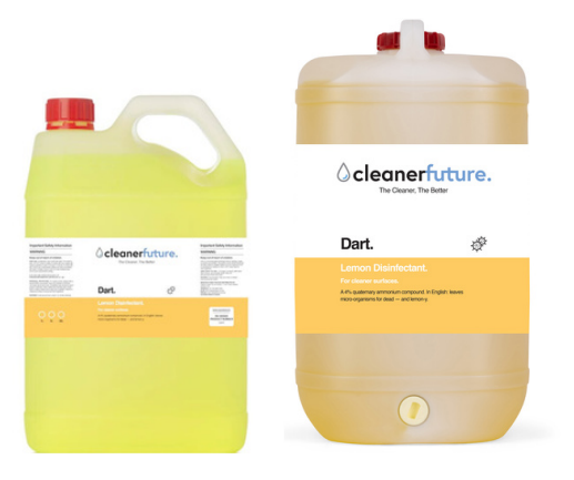
Dart Lemon Disinfectant Part Number: DART-529 Available in: 5L, 15L

This effective multipurpose cleaner contains natural orange oil to enhance its cleaning abilities whilst leaving a subtle smell. Perfect for front of house areas and amenities.