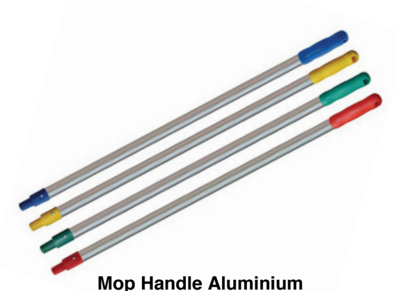
Part Number: CFMHA Available in: Red, Green, Yellow, Blue