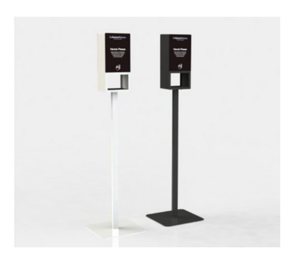
Cleaner Future Complete Automatic Dispenser & Stand Part Number: CADS Available in: Black or white