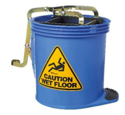
Mop Bucket Part Number: CFMB Available in: Red, Yellow, Blue, Green