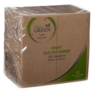
Kraft Quilted Dinner Napkins Part Number: KQDGT Available in: 400mm x 400mm

Bring a new level of cleanliness to your washroom and wet areas, with Duro's high-performing range of wipers. With superior strength, absorbency and versatility, these heavy duty blue wipers measure 50cm x 30cm for a comprehensive clean. These wipers are a quality solution, perfect for industry and healthcare where hygiene and cleanliness are paramount. The 35DWB are certified to be used in food zone secondary and suitable for use in facilities that operate in accordance with a HACCP based Food Safety Programme noting the conditions of the certification statement Food Zone Classification: FZS. For more info go to the HACCP Website.