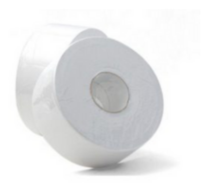
Recycled Jumbo 2ply 300m Part Number: 300CR

The individually wrapped Duro Toilet Paper Rolls with 400 comfortable 2 ply sheets are a stylish and economical option for busy washrooms. Suited for the D3TRP dispenser.