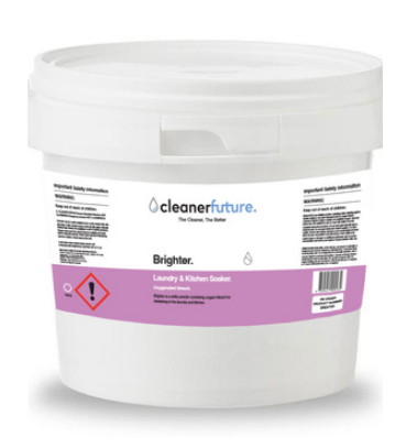
Brighter Laundry & Kitchen Soaker Part Number: BRIGHTER10KG Available in: 10KG

A build up of lime scale in your warewashing machines and water baths come from hard water and calcium deposits. This can ultimately hinder the performance and longevity of you expensive equipment. Clean it will be.