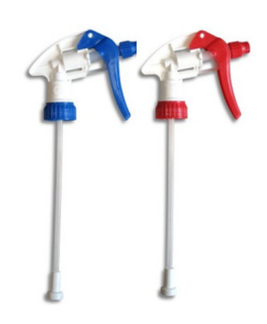
Canyon Trigger Part Number: CTBLU, CTR