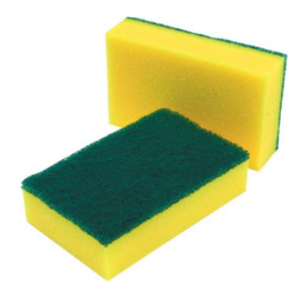
Green Scourer Part Number: GS

Our woven waffle cloths are prefect for glass surfaces including windows and mirrors. The additional strength woven into these cloths are ideal for shower screens. The woven waffle are ideal for all hard surfaces giving you streak free lint free cleaning.