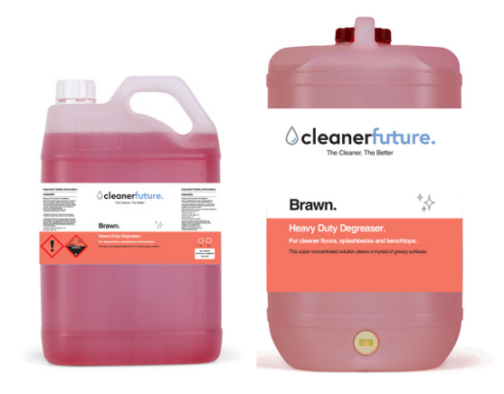
Brawn Heavy Duty Degreaser Part Number: BRAWN-606 Available in: 5L, 15L

Buff is a heavy-duty degreaser used to clean floors, walls, and other surfaces. This alkaline based, and extremely concentrated solution, has been created by Cleaner Future to tackle grease, oil and stubborn floor and wall stains — without leaving any residue behind. Leave it to Buff to do the heavy lifting for you.