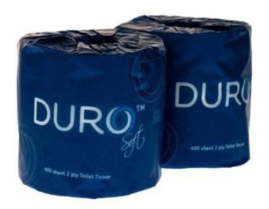
Duro Toilet Roll 2ply 400 Sheet 48 Rolls Part Number: 400V

The individually wrapped Duro Toilet Paper Rolls with 400 comfortable 2 ply sheets are a stylish and economical option for busy washrooms. Suited for the D3TRP dispenser.