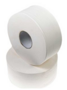
Duro Jumbo 2ply 300m Part Number: 300V

The individually wrapped Duro Toilet Paper Rolls with 400 comfortable 2 ply sheets are a stylish and economical option for busy washrooms. Suited for the D3TRP dispenser.