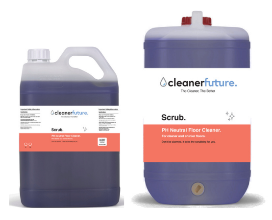
Scrub PH Neutral Floor Cleaner Part Number: SCRUB-619 Available in: 5L, 15L

Introducing Scrub. Scrub is a PH neutral floor cleaner designed for polished floors and other hard surfaces. Commonly used in auto-scrubbing machines