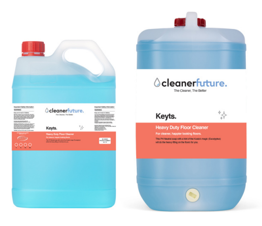
Keyts PH Neutral Floor Cleaner Part Number: KEYTS Available in: 5L, 15L

Brawn is a high foaming, heavy duty concentrated degreaser commonly used in food prep and food manufacturing areas. It has excellent animal grease cutting ability so is suited for floors, splashbacks, bench tops where common animal fats need to be saponified. Use your brain, use Brawn.