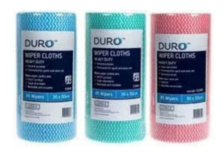
Duro Wiper Cloths Part Number: 35DWB