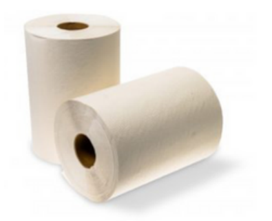
Hand Towel Roll 80m Part Number: 00080G

The Caprice Jumbo Toilet Paper Roll is 300 metres in length and is a comfortable, practical and simple hygiene solution for high-volume washrooms. The Jumbo Roll is two ply for comfort and long-lasting versatility.