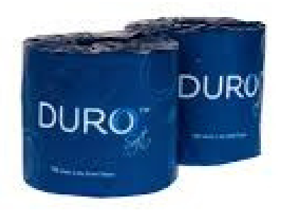
Duro Toilet Roll 2ply 700 Sheet 48 Rolls Part Number: 700V

The Duro roll towel offers fast absorption and versatility, and is a perfect fit for your hospitality venue, cleaning business or healthcare facility. It is manufactured in Australia with care from quality materials, giving it top-notch dependability. This variety is compatible with our DRT paper towel dispensers.