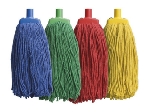
Mop Heads 400g Part Number: CFMH Available in: Red, Yellow, Blue, Green

Commercial grade scourer that removes tough built up grime. Ideal for cleaning pots and metal surfaces.