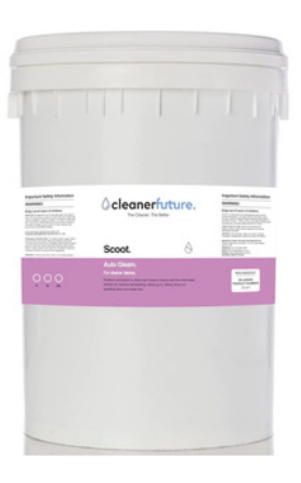
Scoot Auto Dishwashing Powder Part Number: SCOOT GD20KG Available in: 5KG, 10KG, 20KG

Brighter is a multipurpose powder containing an oxygen bleach for stain removal. Brighter also contains water softening agents, alkaline builders, non-ionic detergents.