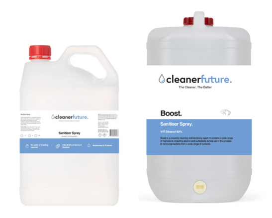
Boost Alcohol Surface Spray - 60% Ethanol Part Number: BOOST-102 Available in: 5L, 15L

Dart is commercial grade disinfectant used for cleaning a variety of surfaces and amenities. This powerful, lemon scented bactericide, has been created by Cleaner Future to kill micro-organisms found on everything from table tops to floors. Dart means dead for micro-organisms.