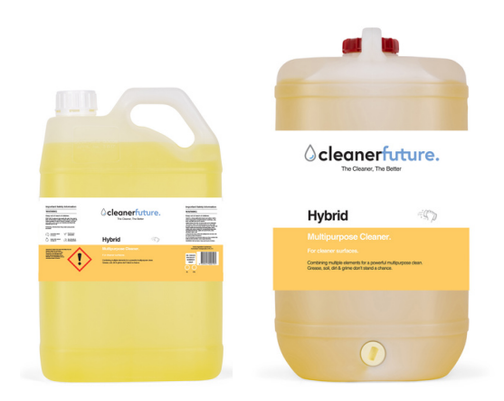
Hybrid Multipurpose Cleaner Part Number: HBMP Available in: 5L, 15L

Hybrid is a strong multifaceted cleaner and sanitiser. Built to remove tough grease and grime found on countertops, walls, floors, and other food service surfaces.