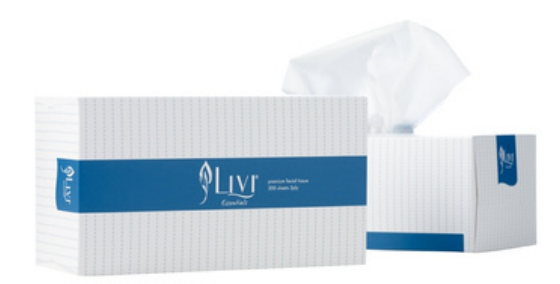
Facial Tissues 2ply 200 Sheet Part Number: LIVI302

The Caprice Green range of toilet paper products is wholly recycled and provides a sustainable option for hospitality and business. The Jumbo Toilet Paper Roll from the Caprice Green collection is an ideal, quality solution for both economic value and environmental sustainability. Three hundred metres in length and two-ply for comfort and convenience. Perfect for busy washrooms.