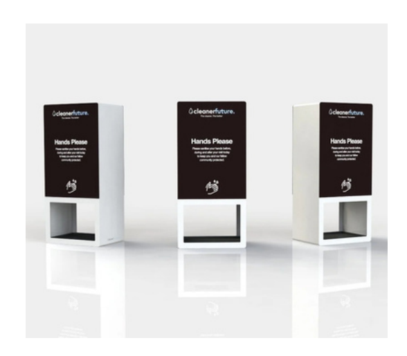
Cleaner Future Automatic Sanitiser Dispenser Part Number: ASU Available in: Black or white