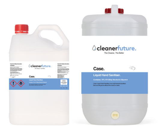
Case Liquid Hand Sanitiser Part Number: CASE-302T Available in: 5L, 15L

Boost sanitiser spray is a powerful cleaner and sanitiser with a bright and crisp aroma that is capable of killing both gram positive and gram negative organisms whilst giving a heavy duty clean to the surface leaving a nice, but subtle smell. Perfect for hard surfaces including marble, stainless steel ect.