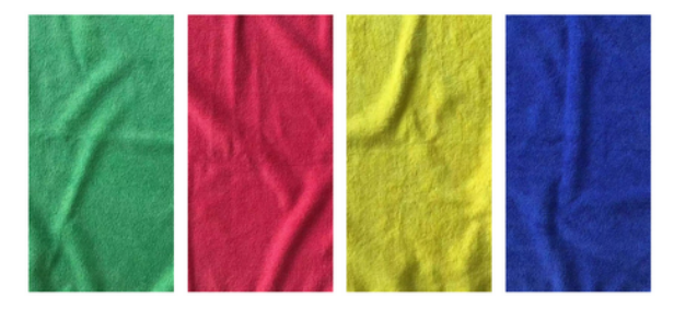
Microfibre Cloth Assorted 10 Pack Part Number: CFMFB, CFMFY, CFMFR, CFMFG