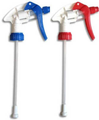
Canyon Trigger Part Number: CTBLU, CTR