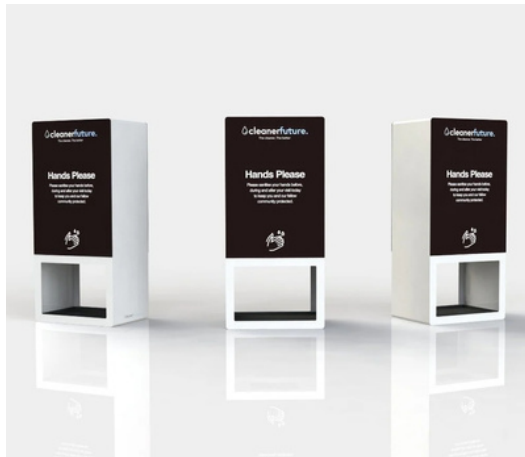
Cleaner Future Automatic Sanitiser Dispenser Part Number: ASU Available in: Black or white