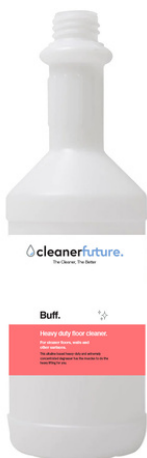
Buff 750ml Empty Bottle Part Number: BUFF-750