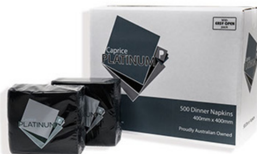
Platinum Dinner Napkin Black GT Part Number: WQC

The Duro quilted dinner napkin with GT fold is a versatile option for all your catering and hospitality needs. Offering superior strength, absorbency and consistent performance, these classic white napkins are a quality solution you can rely upon.