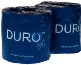
Duro Toilet Roll 2ply 400 Sheet 48 Rolls Part Number: 400V

The individually wrapped Duro Toilet Paper Rolls with 400 comfortable 2 ply sheets are a stylish and economical option for busy washrooms. Suited for the D3TRP dispenser.