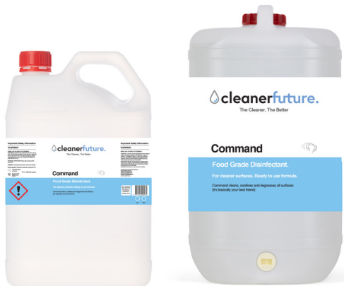
Command Food Grade RTU Disinfectant Part Number: CFGD-RTU Available in: 5L, 15L

Command is a powerful, all-in-one anti-bacterial used for cleaning a variety of surfaces and amenities. Command not only kills 99.9% of all bacteria, Command cleans grease, oil, mould, and grime whilst delivering a potent antimicrobial element. This super concentrated eucalyptus scented sanitiser has been created by Cleaner Future to kill 99.9% of harmful bacteria and viruses found on food prep areas and amenities. Command has been tested* by an accredited Australian laboratory and proven to be effective against COVID- 19. Commands kill rates are: • E Coli • P Vulgaris • S. Typhosa and Salmonella