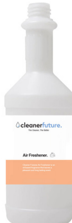
Mountain Air 750ml Empty Bottle Part Number: MOUEB-750