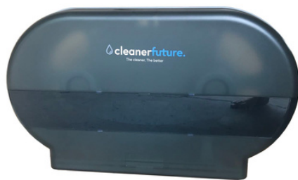
Jumbo Toilet Roll Holder Part Number: CFJTRH Available in: Black

First impressions count, especially in the bathrooms. Cleaner Futures sleek and functional jumbo toilet roll holder creates simplicity in design and ease of use.