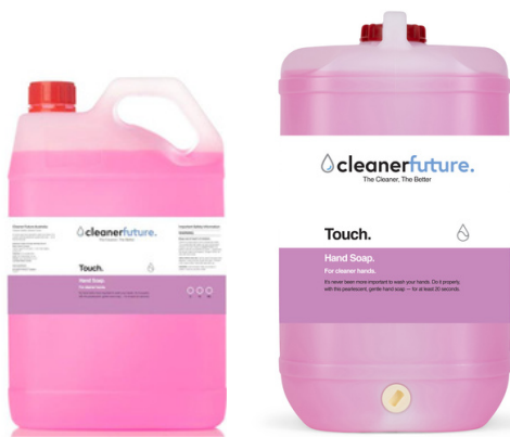
Touch Hand Soap Part Number: TOUCH-830 Available in: 1L, 5L, 15L

Touch is a hand soap for use on exactly that, hands. This exceptionally high quality, and high foaming liquid cleanser, has been created by Cleaner Future to be gentle on the skin and disinfect the hands - suppressing the spread of germs and bacteria. Through Touch, be safe, with clean hands.