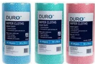
Duro Wiper Cloths Part Number: 35DWB