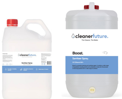
Boost Alcohol Surface Spray - 60% Ethanol Part Number: BOOST-102 Available in: 5L, 15L

Dart is commercial grade disinfectant used for cleaning a variety of surfaces and amenities. This powerful, lemon scented bactericide, has been created by Cleaner Future to kill micro-organisms found on everything from table tops to floors. Dart means dead for micro-organisms.