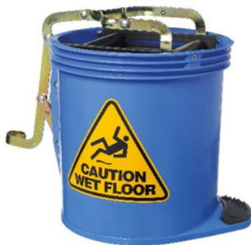
Mop Bucket Part Number: CFMB Available in: Red, Yellow, Blue, Green