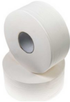
Duro Jumbo 2ply 300m Part Number: 300V

The individually wrapped Duro Toilet Paper Rolls with 400 comfortable 2 ply sheets are a stylish and economical option for busy washrooms. Suited for the D3TRP dispenser.