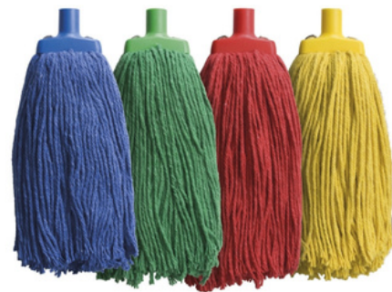
Mop Heads 400g Part Number: CFMH Available in: Red, Yellow, Blue, Green

Commercial grade scourer that removes tough built up grime. Ideal for cleaning pots and metal surfaces.