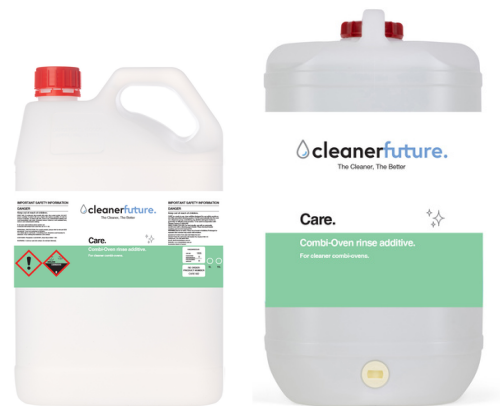
Care Combi Rinse Additive Part Number: CARE-662 Available in: 5L, 15L

Flash is a highly alkaline based product used for cleaning commercial grade hot plates, ovens, stoves, and combi-ovens. This combination of water soluble solvent and powerful surfactant emulsifiers has been created by Cleaner Future to attack grease, oil and fat deposits left post cook. Not a Flash in the pan, but a Flash for the pots and pans.