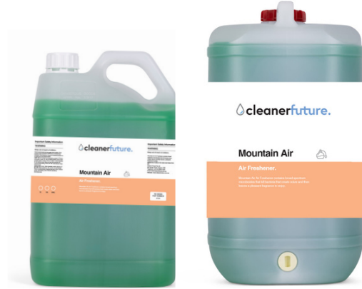
Mountain Air - Air Freshener Part Number: AF-MA Available in: 5L, 15L

Bolt is a high performance laundry detergent safe to use on cottons, synthetics, whites and brights. This liquid solution has been created by Cleaner Future to perform time and time again through the spin cycle — warm or cold. Put Bolt in the machine for a better clean.