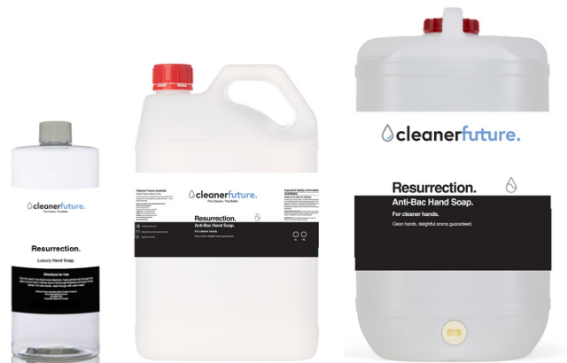
Resurrection Luxury Hand Soap Part Number: RESURRECTION-806 Available in: 1L, 5L, 15L

Bold is an anti-bacterial hand soap that is hard on the disinfect, yet soft on the hands. This mild, but highly effective hand soap has been created by Cleaner Future to help cleanse hands and protect you, right when we need it most. Containing both Bronopol and CMIT for biocidal action — meaning GTFO germs. It's a little Bold, but you need to be to do the job right.