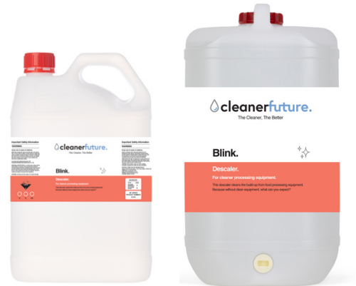
Blink Descaler Part Number: BLINK-562 Available in: 5L, 15L

Rush is a dishwashing drying agent for use in conjunction with Zip in automatic ware washers. This concentrated solution has been created by Cleaner Future to aid in the removal of any trace of detergent and give you a superfast dry. Rush to rinse. Quick to dry.