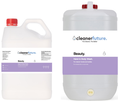
Beauty Hand & Body Wash Part Number: BEAUTY Available in: 1L, 5L, 15L

Beauty is an anti-bacterial hand and body wash used to clean and cleanse. This mild but highly effective soap has been created by Cleaner Future to clean and protect the hands and body