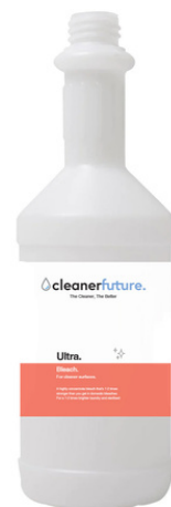
Ultra 750ml Empty Bottle Part Number: ULTEB-750