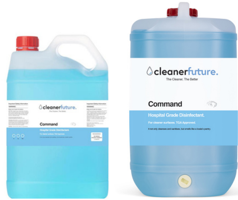
Command Hospital Grade Disinfectant Part Number: CHGD-RTU Available in: 5L, 15L

Command is a powerful, all-in-one anti-bacterial used for cleaning a variety of surfaces and amenities. Command not only kills 99.9% of all bacteria, Command cleans grease, oil, mould, and grime whilst delivering a potent antimicrobial element. This super concentrated eucalyptus scented sanitiser has been created by Cleaner Future to kill 99.9% of harmful bacteria and viruses found on food prep areas and amenities. Command has been tested* by an accredited Australian laboratory and proven to be effective against COVID- 19. Commands kill rates are: • E Coli • P Vulgaris • S. Typhosa and Salmonella