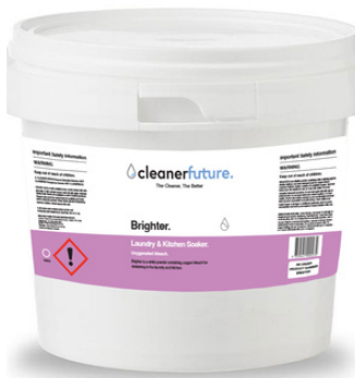
Brighter Laundry & Kitchen Soaker Part Number: BRIGHTER10KG Available in: 10KG

Clean is a non-toxic, biodegradable lime scale remover. It helps descale and remove built up deposits commonly found in your machinery. A build up of lime scale in your warewashing machines and water baths come from hard water and calcium deposits. This can ultimately hinder the performance and longevity of your expensive equipment. Clean it will be.