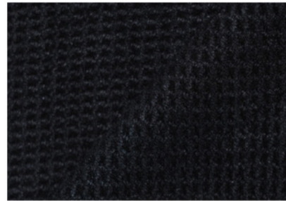
Window Cloth Black Part Number: WCB Available in: Black

250gsm microfibre cloths are perfect for customers who want a good quality microfibre cloth at a budget price. There are endless uses for microfibre cloths such as; Cleaning, Dusting, Drying, Detailing, and Wiping just about ANY SURFACE. 99% of all dust, dirt and germs are lifted from the surface and trapped in the cloth, allowing you to clean with only water and little to no chemicals.