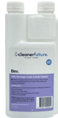
Bev Beverage Tower & Drain Cleaner Part Number: BEV-1L Available in: 1L, 1Lx6

Freeze is a powerful cleaner designed to be used in walk-ins and freezers where most other cleaners will freeze on contact. Freeze is made with an anti-freezing agent, meaning more cleaning and less freezing.