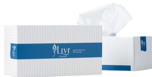
Facial Tissues 2ply 200 Sheet Part Number: LIVI302

The Duro roll towel offers fast absorption and versatility, and is a perfect fit for your hospitality venue, cleaning business or healthcare facility. It is manufactured in Australia with care from quality materials, giving it top-notch dependability. This variety is compatible with our DRT paper towel dispensers.