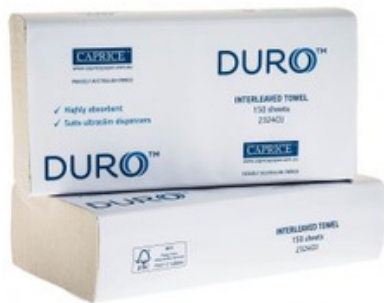
Duro Interleaved Hand Towel Part Number: 2324CU

This Duro interleaved towel provides excellent strength, absorbency and versatility, making it ideal for use in the healthcare and hospitality industries. It's a dependable paper towel that, at 24 centimetres by 23 centimetres, is generously sized for convenience. This product is suitable for the Cleaner Future interleaved dispensers.