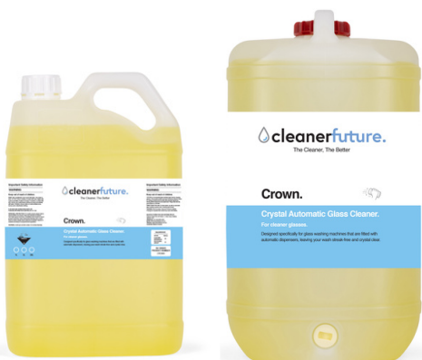
Crown Auto Machine Glass Cleaner Part Number: CROWN-655.5 Available in: 5L, 15L

Buff is a heavy-duty degreaser used to clean floors, walls, and other surfaces. This alkaline based, and extremely concentrated solution, has been created by Cleaner Future to tackle grease, oil and stubborn floor and wall stains — without leaving any residue behind. Leave it to Buff to do the heavy lifting for you.