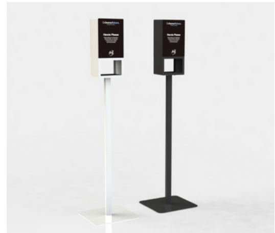
Cleaner Future Complete Automatic Dispenser & Stand Part Number: CADS Available in: Black or white