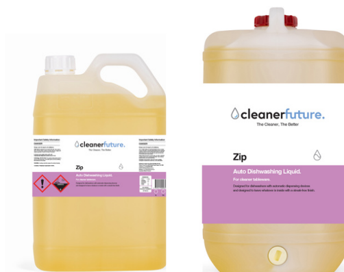
Zip Machine Dishwasher Liquid Part Number: ZIP-655 Available in: 5L, 15L

Crown is a concentrated glass washing agent used for cleaning glasses. This powerful solution has been created by Cleaner Future for washing machines that are fitted with automatic dispensers — leaving glasses streak free and crystal clear. Things that work this good deserve a Crown.