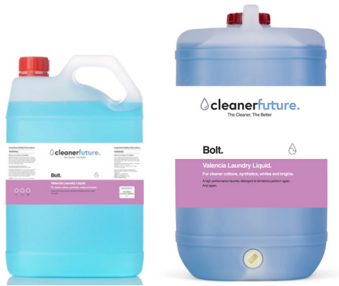
Bolt Valencia Laundry Liquid Part Number: BOLT-753 Available in: 5L, 15L

Bolt is a high performance laundry detergent safe to use on cottons, synthetics, whites and brights. This liquid solution has been created by Cleaner Future to perform time and time again through the spin cycle — warm or cold. Put Bolt in the machine for a better clean.