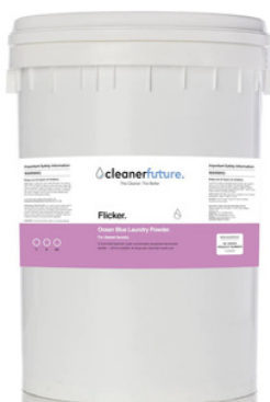
Flicker Laundry Powder Part Number: FLICKER GD Available in: 5KG, 10KG, 20KG

Flicker is a super concentrated laundry powder used to get the best out of your whites and brights. This chemically balanced, phosphate-free powder, has been created by Cleaner Future to perform time and time again through the spin cycle — warm or cold. A little Flicker to the beat of the clean.