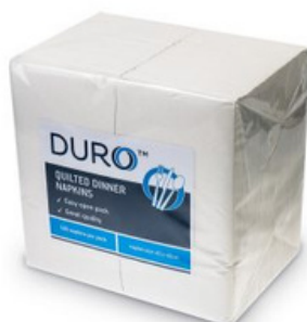
Duro Quilted Dinner White GT Fold Part Number: WQDEGT

The Caprice Green range of paper products is wholly recycled, providing a sustainable option for hospitality and business. Our Caprice Green Quilted Dinner GT fold napkins in natural Kraft go well with any décor and setting. They measure 40mm x 40mm and are fully recycled, offering a sustainable option for hospitality, boardroom lunches and catered events. In addition we offer a personalised printing service for these napkins. For hospitality, businesses or any company seeking sustainable napkins, Caprice Green Kraft GT fold napkins are the ideal choice.