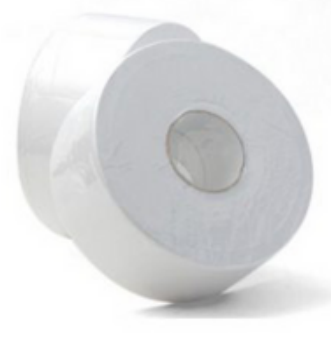
Recycled Jumbo 2ply 300m Part Number: 300CR

The Caprice Jumbo Toilet Paper Roll is 300 metres in length and is a comfortable, practical and simple hygiene solution for high-volume washrooms. The Jumbo Roll is two ply for comfort and long-lasting versatility.