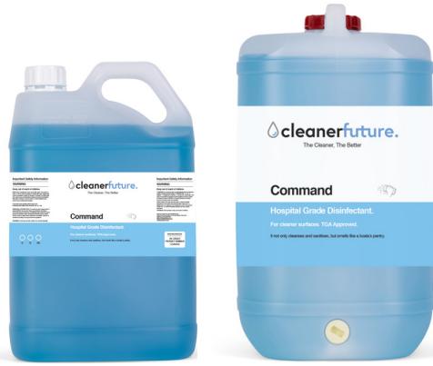
Command Hospital Grade Disinfectant TGA Approved Part Number: CHGD Available in: 5L, 15L