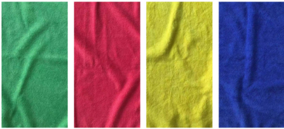
Microfibre Cloth Assorted 10 Pack Part Number: CFMFB, CFMFY, CFMFR, CFMFG Available in: Green, Red, Yellow, Blue

250gsm microfibre cloths are perfect for customers who want a good quality microfibre cloth at a budget price. There are endless uses for microfibre cloths such as; Cleaning, Dusting, Drying, Detailing, and Wiping just about ANY SURFACE. 99% of all dust, dirt and germs are lifted from the surface and trapped in the cloth, allowing you to clean with only water and little to no chemicals.