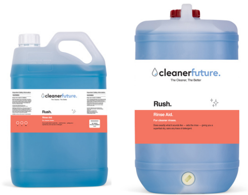
Rush Rinse Aid Part Number: RUSH-609 Available in: 5L, 15L

Rush is a dishwashing drying agent for use in conjunction with Zip in automatic ware washers. This concentrated solution has been created by Cleaner Future to aid in the removal of any trace of detergent and give you a superfast dry. Rush to rinse. Quick to dry.