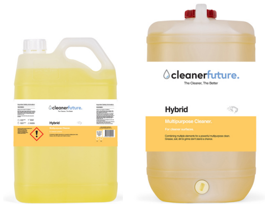
Hybrid Multipurpose Cleaner Part Number: HBMP Available in: 5L, 15L

Hybrid is a strong multifaceted cleaner and sanitiser. Built to remove tough grease and grime found on countertops, walls, floors, and other food service surfaces. This effective multipurpose cleaner contains natural orange oil to enhance its cleaning abilities whilst leaving a subtle smell. Perfect for front of house areas and amenities.