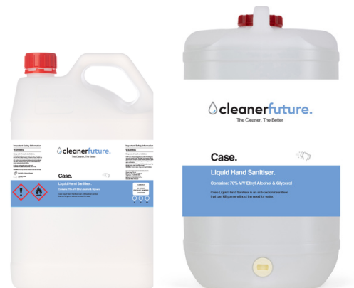
Case Liquid Hand Sanitiser Part Number: CASE-302T Available in: 5L, 15L

Boost sanitiser spray is a powerful cleaner and sanitiser with a bright and crisp aroma that is capable of killing both gram positive and gram negative organisms whilst giving a heavy duty clean to the surface leaving a nice, but subtle smell. Perfect for hard surfaces including marble, stainless steel ect.