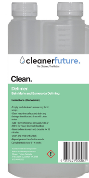
Clean Delimer Part Number: CLEAN-562 Available in: 1L

Grill is a fast-acting, concentrated detergent which is designed for removing fat, grease, carbon and burnt-on food residues from ovens, grills, hotplates, and deep fryers. Contains: Benzyl alcohol, Triethanolamine, Potassium Hydroxide.