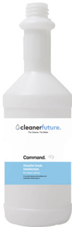
Command 750ml Empty Bottle Part Number: CEB-750