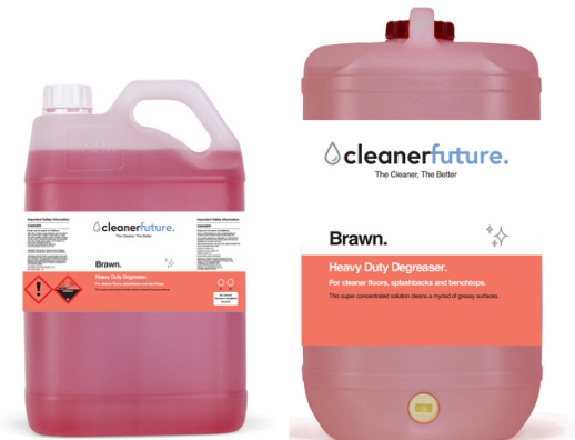
Brawn Heavy Duty Degreaser Part Number: BRAWN-606 Available in: 5L, 15L

Buff is a heavy-duty degreaser used to clean floors, walls, and other surfaces. This alkaline based, and extremely concentrated solution, has been created by Cleaner Future to tackle grease, oil and stubborn floor and wall stains — without leaving any residue behind. Leave it to Buff to do the heavy lifting for you.