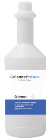
Glimmer 750ml Empty Bottle Part Number: GEB-750