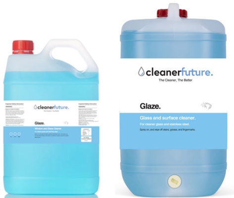
Glaze Window and Glass Cleaner Part Number: GLAZE-607 Available in: 5L, 15L

Maxi is chlorinated detergent used for cleaning laundries, toilets, and bathrooms. This powerful, concentrated solution, has been created by Cleaner Future to deodorise and disinfect with a high foam and refreshing fragrance. When you need Maxi, let it do the work for you.