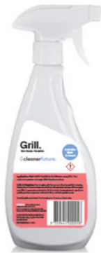
Grill Detergent Part Number: GC-655-750 Available in: 750ML

Grill is a fast-acting, concentrated detergent which is designed for removing fat, grease, carbon and burnt-on food residues from ovens, grills, hotplates, and deep fryers. Contains: Benzyl alcohol, Triethanolamine, Potassium Hydroxide.