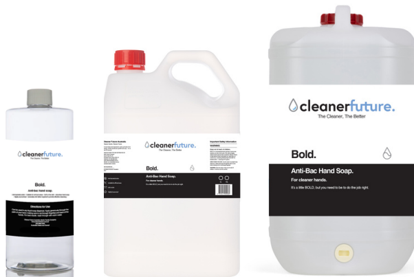
Bold Anti-Bac Hand Soap Part Number: BOLD-799 Available in: 1L, 5L, 15L

Silk is a hand soap for use on exactly that, hands. This exceptionally high quality, and high foaming liquid cleanser, has been created by Cleaner Future to be gentle on the skin and disinfect the hands — suppressing the spread of germs and bacteria. Through Silk, be safe, with clean hands.