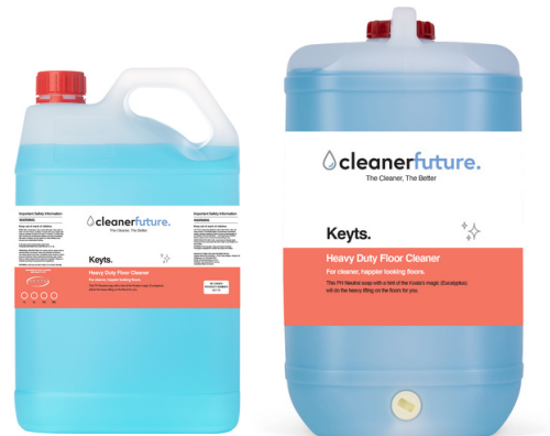
Keys PH Neutral Floor Cleaner Part Number: KEYTS Available in: 5L, 15L

Brawn is a high foaming, heavy duty concentrated degreaser commonly used in food prep and food manufacturing areas. It has excellent animal grease cutting ability so is suited for floors, splashbacks, bench tops where common animal fats need to be saponified. Use your brain, use Brawn.