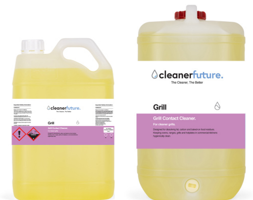
Grill Cleaner Part Number: GC-655 Available in: 5L, 15L

Care is a ready to use, rinse additive designed for use within combi-ovens fully automated cleaning system. It is fed automatically into the oven via a dispenser pump, neutralising any alkaline detergent residue to guarantee an effective rinse process.