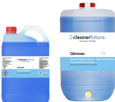
Glimmer Window & Glass Cleaning Part Number: GLIMMER Available in: 5L, 15L

Mountain Air Air Freshener contains broad spectrum microbicides that kill bacteria that create odours and then leaves a pleasant fragrance to enjoy.