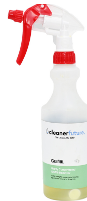
Graffiti Remover Part Number: GR-500 Available in: 500ML

Glimmer is a super concentrated window and glass cleaner. It is commonly used through the Cleaner Future auto dosing system. It is 3 times stronger than your regular which means less chemical being used and powerful spray and wipe action. This solution has been created by Cleaner Future to remove stains, grease and those ugly finger marks from glass and stainless steel.