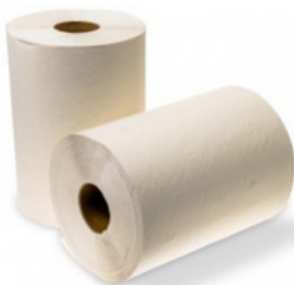
Hand Towel Roll 80m Part Number: 00080G

The Caprice Green range of toilet paper products is wholly recycled and provides a sustainable option for hospitality and business. The Jumbo Toilet Paper Roll from the Caprice Green collection is an ideal, quality solution for both economic value and environmental sustainability. Three hundred metres in length and two-ply for comfort and convenience. Perfect for busy washrooms.