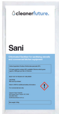
Sani Sanitiser Part Number: CFSS9G Available in: 9G

Sani is a Chlorinated Sanitiser to be used for sanitising utensils and commercial kitchen equipment.