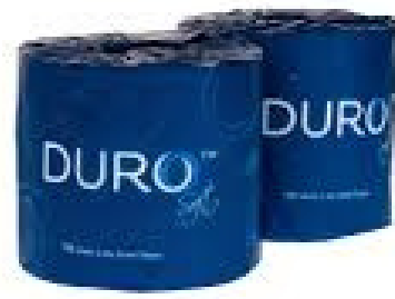
Duro Toilet Roll 2ply 700 Sheet 48 Rolls Part Number: 700V

The individually wrapped Duro Toilet Paper Rolls with 400 comfortable 2 ply sheets are a stylish and economical option for busy washrooms. Suited for the D3TRP dispenser.