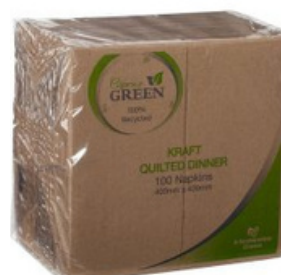
Kraft Quilted Dinner Napkins Part Number: KQDGT

These wipers are a quality solution, perfect for industry and healthcare where hygiene and cleanliness are paramount. The 35DWB are certified to be used in food zone secondary and suitable for use in facilities that operate in accordance with a HACCP based Food Safety Programme noting the conditions of the certification statement Food Zone Classification: FZS. For more info go to the HACCP Website.