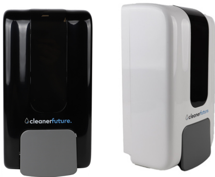
Manual Soap Dispenser Part Number: CF-MSDB Available in: Satin Black & Gloss White

Cleaner Future brings you the anti-bacterial manual Sani dispenser. Enhance your venue through look, feel and hygiene. Use in conjunction with Cleaner Futures 'Silk or Touch'.