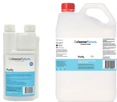
Purify Sanitiser & Cleaner Part Number: PURIFY Available in: 1L, 5L, 15L

Zing Isopropyl Alcohol is a high quality hard surface cleaner created by Cleaner Future with a high evaporation rate. It has many different applications around the home and office.