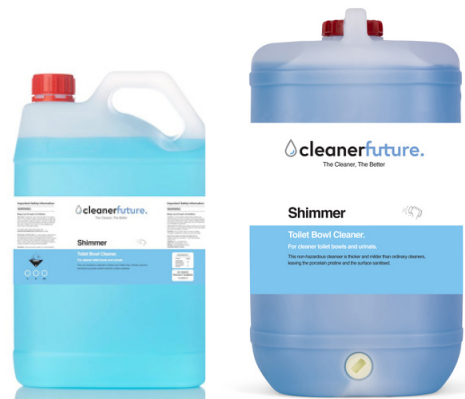
Shimmer Toilet Bowl Cleaner Part Number: SHIMMER-561 Available in: 5L, 15L

Shimmer is a non-hazardous cleanser used to disinfect and deodorise toilets and urinals. The solution is thicker and milder than most ordinary cleaners and has been created by Cleaner Future to do the best on the porcelain, stainless steel, and surrounding areas. So, let Shimmer do exactly that.