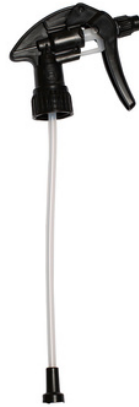
Canyon Trigger Black Part Number: CTBL