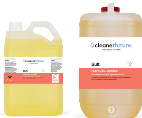
Buff Heavy Duty Degreaser Part Number: BUFF-599 Available in: 5L, 15L

For cleaner dishes you find in the sink. Goes on green, comes off clean. Strike is a general-purpose dishwashing detergent used for washing the plates and pans, knives and forks. This green coloured solution has been created by Cleaner Future as a heavy-duty cleaner for when the lighter duty just won't do. Let Strike do what it does, and what it does, is better than the rest.