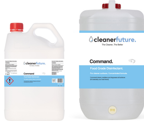
Command Food Grade Disinfectant Part Number: CFGD Available in: 5L, 15L

Command is a powerful, all-in-one anti-bacterial used for cleaning a variety of surfaces and amenities. Command not only kills 99.9% of all bacteria, Command cleans grease, oil, mould, and grime whilst delivering a potent antimicrobial element. This super concentrated eucalyptus scented sanitiser has been created by Cleaner Future to kill 99.9% of harmful bacteria and viruses found on food prep areas and amenities. Command has been tested* by an accredited Australian laboratory and proven to be effective against COVID- 19. Commands kill rates are: • E Coli • P Vulgaris • S. Typhosa and Salmonella