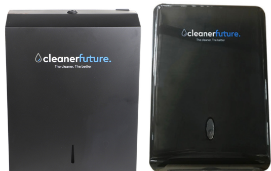
Interlaved Hand Towel Dispenser Part Number: CFIHTD Available in: Black Metal, Black Plastic

First impressions count, especially in the bathrooms. Cleaner Futures sleek and functional interlaved hand towel dispenser delivers just that.