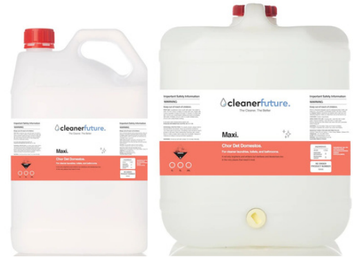
Maxi Chlor Det Domestos Part Number: MAXI GD Available in: 5L, 20L

Ultra is just that, when only Ultra will do.