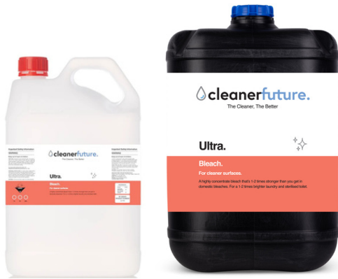
Ultra Bleach Part Number: ULTRA-625 Available in: 5L, 25L

Ultra is a power punch of clean used for laundries, toilets, showers, and bathrooms. This highly concentrated bleach created by Cleaner Future is 1-2 times stronger than domestic bleaches, leaving surfaces and ceramics whiter and brighter, then sterilised and deodorised.