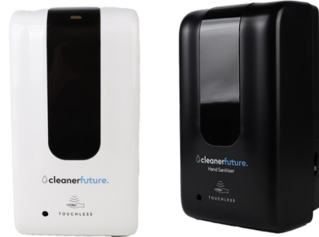
Automatic Soap Dispenser Part Number: CF-ASD Available in: Satin Black & Gloss White

Beauty is an anti-bacterial hand and body wash used to clean and cleanse. This mild but highly effective soap has been created by Cleaner Future to clean and protect the hands and body