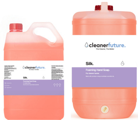
Silk Foaming Hand Soap Part Number: SILK Available in: 1L, 5L, 15L

Touch is a hand soap for use on exactly that, hands. This exceptionally high quality, and high foaming liquid cleanser, has been created by Cleaner Future to be gentle on the skin and disinfect the hands - suppressing the spread of germs and bacteria. Through Touch, be safe, with clean hands.