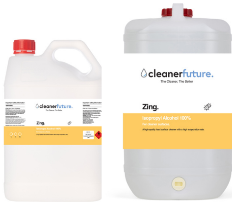
Zing Isopropyl Alcohol 100% Part Number: ZING Available in: 5L, 15L

Zing Isopropyl Alcohol is a high quality hard surface cleaner created by Cleaner Future with a high evaporation rate. It has many different applications around the home and office.