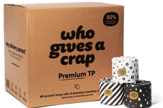
Premium Bamboo Who Gives A Crap Toilet Paper

This Duro interleaved towel provides excellent strength, absorbency and versatility, making it ideal for use in the healthcare and hospitality industries. It's a dependable paper towel that, at 24 centimetres by 23 centimetres, is generously sized for convenience. This product is suitable for the Cleaner Future interleaved dispensers.