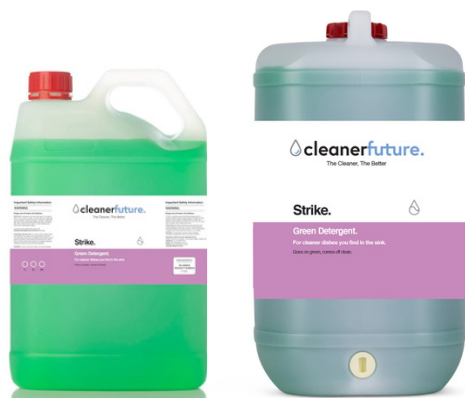
Strike Dishwashing Liquid Part Number: STRIKE-610 Available in: 5L, 15L

For cleaner dishes you find in the sink. Goes on green, comes off clean. Strike is a general-purpose dishwashing detergent used for washing the plates and pans, knives and forks. This green coloured solution has been created by Cleaner Future as a heavy-duty cleaner for when the lighter duty just won't do. Let Strike do what it does, and what it does, is better than the rest.