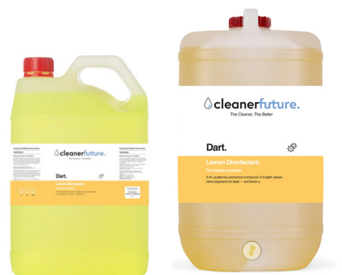
Dart Lemon Disinfectant Part Number: DART-529 Available in: 5L, 15L

Hybrid is a strong multifaceted cleaner and sanitiser. Built to remove tough grease and grime found on countertops, walls, floors, and other food service surfaces. This effective multipurpose cleaner contains natural orange oil to enhance its cleaning abilities whilst leaving a subtle smell. Perfect for front of house areas and amenities.