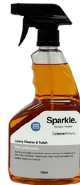
Sparkle Luxury Cleaner & Polish Part Number: SPARKLE-750ML Available in: 750ML

Sani is a Chlorinated Sanitiser to be used for sanitising utensils and commercial kitchen equipment.