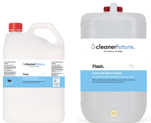
Flash Oven and Stove Cleaner Part Number: FLASH-656 Available in: 5L, 15L

Blink is a descaler used to clean build up faster and more effectively than other cleaners. This powerful, yet gentle solution, has been created by Cleaner Future to safely remove food, scale, and rust build-up on commercial food processing equipment. Let Blink be the tool to get yours working more efficiently.