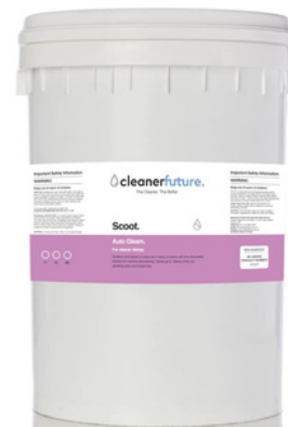
Scoot Auto Dishwashing Powder Part Number: SCOOT GD20KG Available in: 5KG, 10KG, 20KG

Brighter is a multipurpose powder containing an oxygen bleach for stain removal. Brighter also contains water softening agents, alkaline builders, non-ionic detergents.