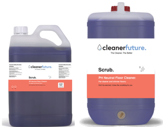
Scrub PH Neutral Floor Cleaner Part Number: SCRUB-619 Available in: 5L, 15L

Introducing Scrub. Scrub is a PH neutral floor cleaner designed for polished floors and other hard surfaces. Commonly used in auto-scrubbing machines