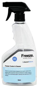
Freeze Cooler & Cleaner Part Number: FREEZE594 Available in: 750ML

Sparkle is formulated to provide the ultimate cleaning and polishing on a wide variety of surfaces. These include, metal, wood, hard plastic and stainless. Sparkle you shall see!