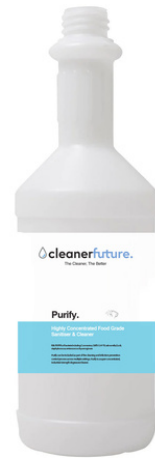
Purify 750ml Empty Bottle Part Number: PUR-750