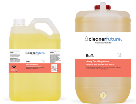
Buff Heavy Duty Degreaser Part Number: BUFF-599 Available in: 5L, 15L

Introducing Scrub. Scrub is a PH neutral floor cleaner designed for polished floors and other hard surfaces. Commonly used in auto-scrubbing machines