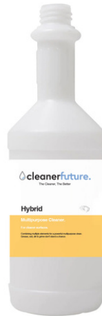
Hybrid 750ml Empty Bottle Part Number: HYBEB-750