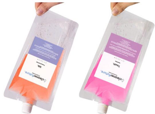
1L Refill Bladders Part Number: BLADDER Available in: 1L Touch, 1L Beauty, 1L Silk

To be used in conjunction with Cleaner Future Soap Dispensers.