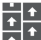
Half Drop / Ashlar