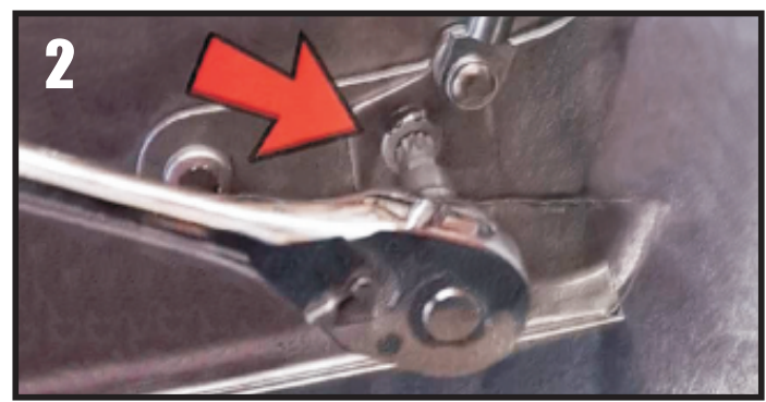
Fitting the down strut