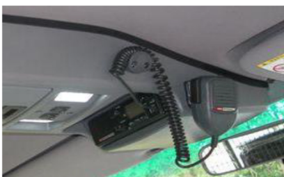
Microphone clip on slight angle

Install in a position that suits best, depending on vehicle and Radio model. Ensure microphone or microphone cable and holder does not foul on sun visor when pulled down.