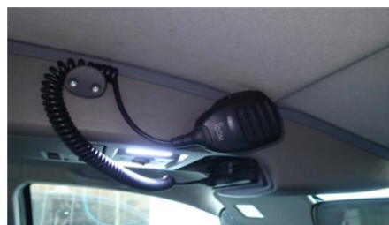
Left hand cable outlet radios