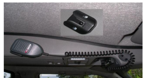
Microphone clip on acute angle