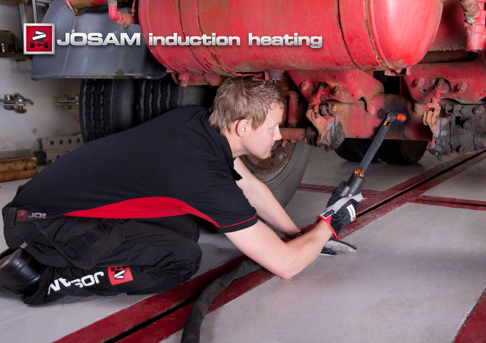
Heating of trailer axle for wheel alignment.