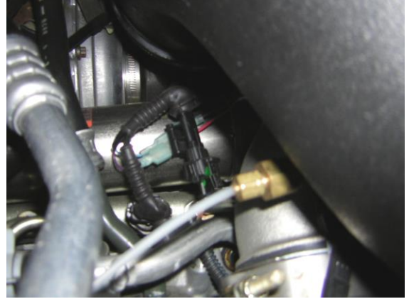
LLY Fuel Rail Pressure Sensor