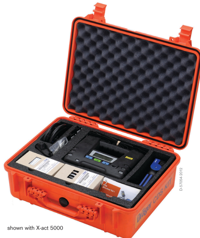
shown with X-act 5000

The Dräger CDS Kit uses specialized Dräger simultaneous tube sets to quickly and reliably detect the presence of nerve, blister, blood and choking agents.