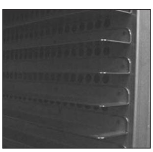
Optional fixed angle slides