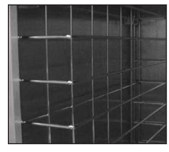
Standard universal wire slides

PAN SLIDES... Universal wire slides at fixed spacing of 3". Assemblies removable. Hold 18"x26" sheet pans, 12"x20" steam table pans, 2/1 or 1/2 G/N pans. Adjustable universal stainless steel pan slides or fixed angle slides are optional.