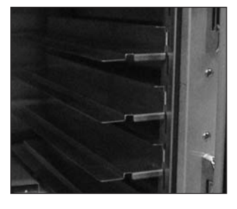
Optional stainless steel adjustable universal slides