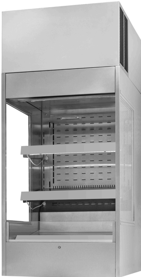
Shown with optional stainless exterior and interior finish

Designed to drive impulse sales of packaged food where retail space is limited.