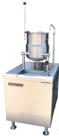
*Not as shown.