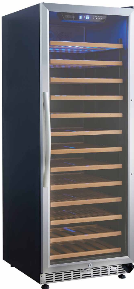
USF128S - Single Temperature