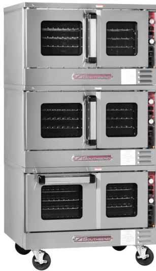
TVES/30SC shown with optional casters