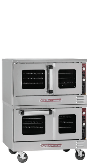
TVES/20SC shown with optional casters