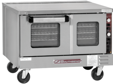
TVES/10SC shown with optional casters