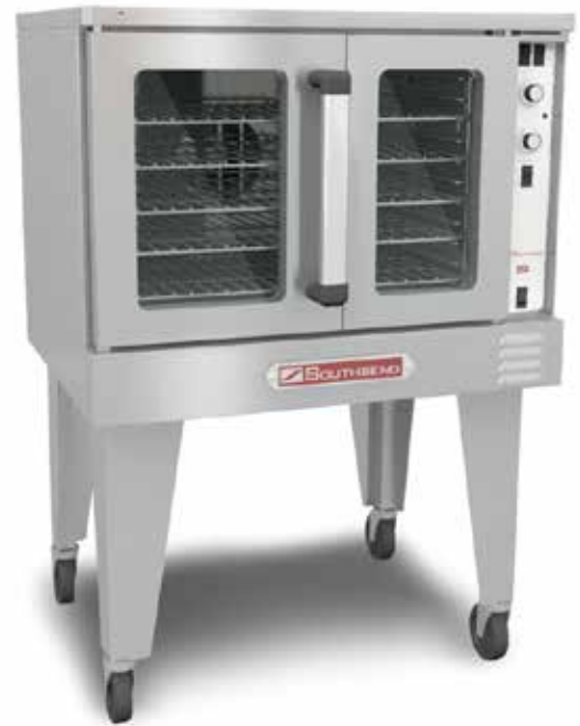
(SLGS/12SC shown with optional casters)