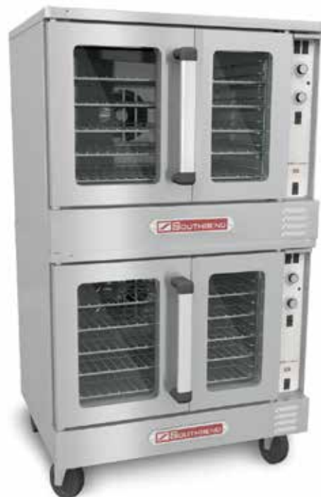
(SLES/20SC shown with optional casters)

SLES/20SC, SLES/20CCH SLEB/20SC, SLEB/20CCH