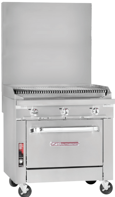
P36D-CCC w/ optional casters and flue riser.