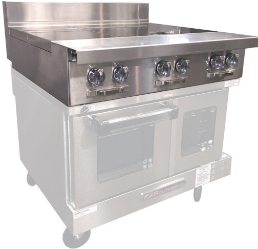
Model P36T-III shown

For use with induction safe cookware ONLY. Look for the induction ready logo below.