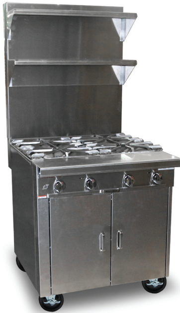
Model P32A-XX with optional 36" flue riser, optional removable cast iron grate tops and optional casters