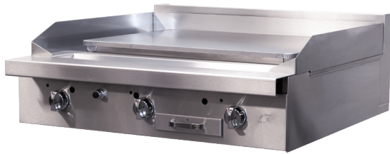
Model Shown P32N-PPP

** PLANCHA UNITS DO NOT ALLOW SPECIFIC TEMPERATURE OPERATION **