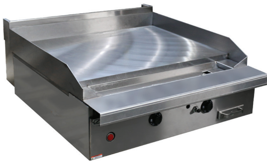
Model P32N-TT shown

** MANUAL GRIDDLES DO NOT ALLOW SPECIFIC TEMPERATURE OPERATION **