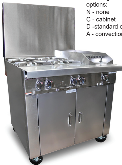
Model P36C-BBC with optional 24" flue riser

*All configurations available with the following oven base options: N - none C - cabinet D - standard oven A - convection oven