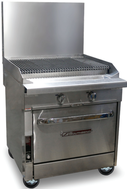
Model P32A-CC shown with optional 24" flue riser and optional casters