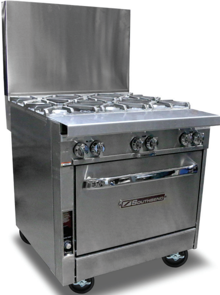
Model P32A-BBB shown with optional 24" flue riser and casters