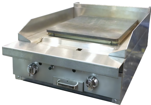
Model P24N-PP shown

** PLANCHA UNITS DO NOT ALLOW SPECIFIC TEMPERATURE OPERATION **