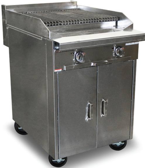
Model P24C-CC shown with optional casters