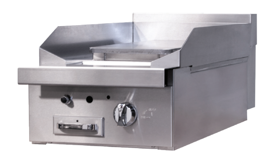
Model P18N-P shown

** PLANCHA UNITS DO NOT ALLOW SPECIFIC TEMPERATURE OPERATION **