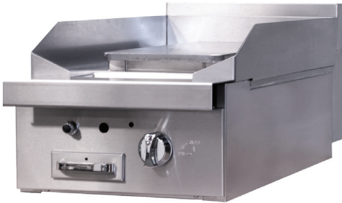
Model P16N-P shown

** PLANCHA UNITS DO NOT ALLOW SPECIFIC TEMPERATURE OPERATION **