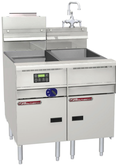
NOD14 / NODR14 (Pasta Cooker and Rinse Station Sold Separately)