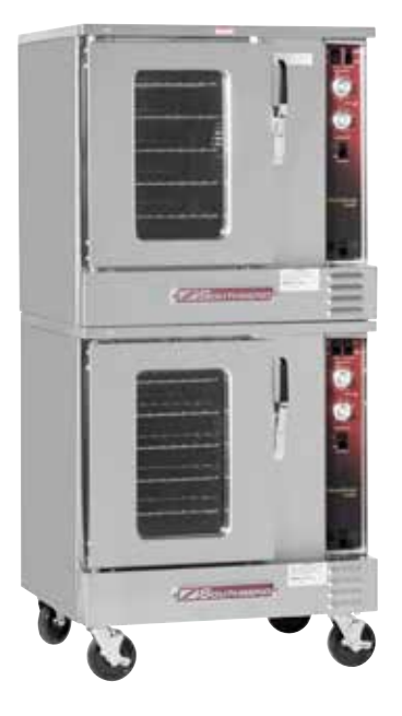
(GH/20SC shown with optional casters)

150°F to 550°F temperature controller with 140°F to 200°F "Hold" thermostat. Dual digital display shows time and temperature. A fan cycle timer pulses the fan.