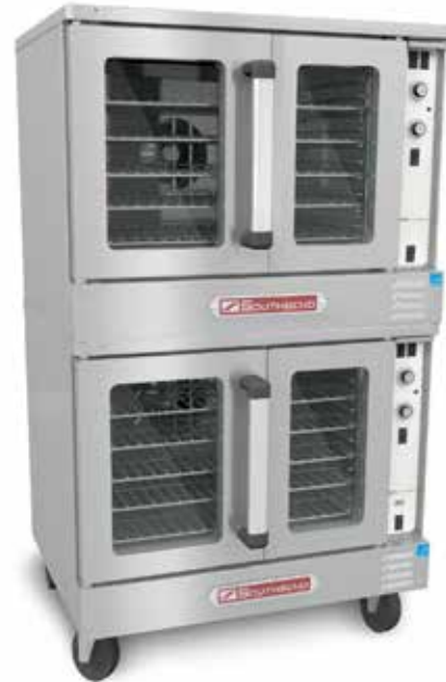
(shown with optional casters)