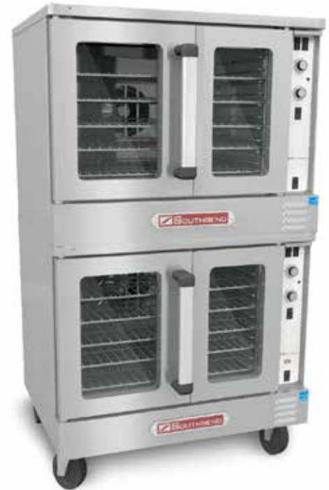
(BES/27SC shown with optional casters)