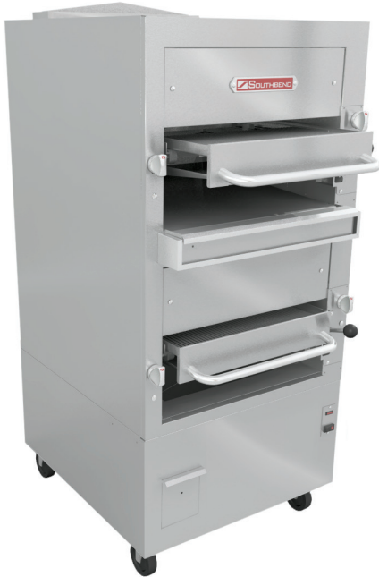
(shown with optional casters)

Southbend's Double Radiant Broilers combine speed, efficiency and output in a broiler that just won't quit. From the rugged, welded steel broiler grids to the dependable grid adjustment mechanism, Southbend's Broilers are built tough to last.